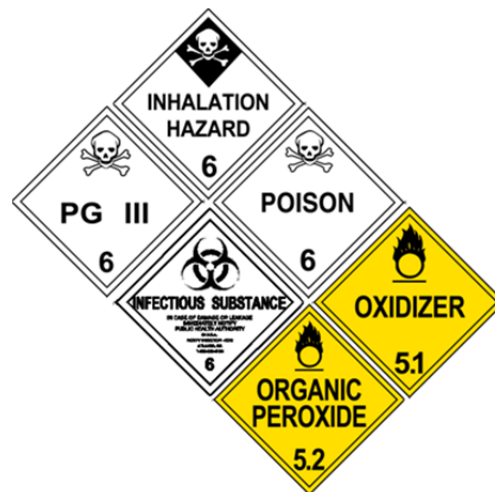
Examples of HM Labels. Figure 9.2

Shippers put diamond-shaped hazard warning labels on most hazardous materials packages. These labels inform others of the hazard. If the diamond label won't fit on the package, shippers may put the label on a tag securely attached to the package. For example, compressed gas cylinders that will not hold a label will have tags or decals. Labels look like the examples in Figure 9.2.