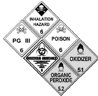
Figure 9.2 Examples of HAZMAT Labels